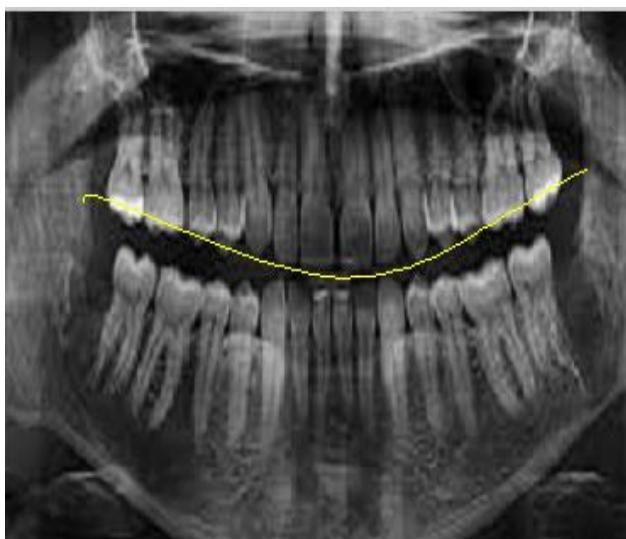
Fig 1: Splines passing through the dental pulp that indicates height on which the necks of teeth can be found and the spline that separates upper and lower jaw (middle line).

First step is to determine the line that separates upper and lower jaw which is shown in fig 1. To carryout automatic segmentation process a horizontal integral projection is chosen that has the lowest value which is closer to the center of image approx between 40%-60% of its height. Only a small number of pixels closer to the earlier chosen frontal teeth gap are used to calculate projection instead of the full horizontal line that would pass through teeth further through the incisors.